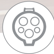
SAE J1772 (Type 1)